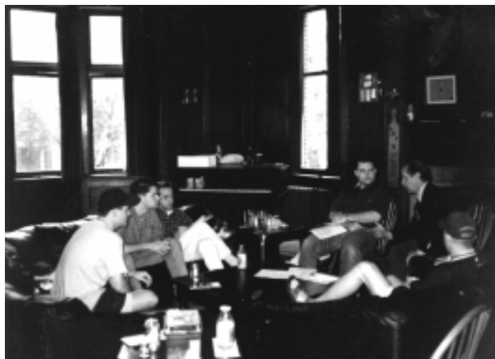
A recent Phi Phi Club meeting.

In 102 years, Penn, Philadelphia, America and the world have changed, and Phi Phi has kept up. Alpha Chi Rho still stands for something. We are leaders of campus, friends, teachers and above all, brothers. Alpha Chi Rho means something different to each of us; what that is must be answered individually. Phi Phi has initiated almost thirteen hundred brothers over the years, and each of them took something from their time here. A common experience for all of today's undergraduates is that this is a great time for Alpha Chi Rho and the future is bright.